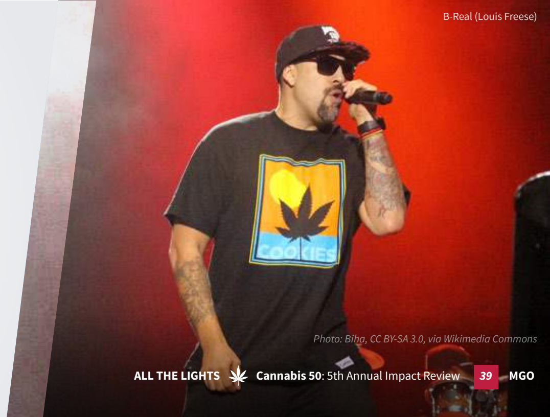
B-Real (Louis Freese)

the group, B-Real launched Dr. Greenthumb’s cannabis products and dispensaries in 2018. The brand has grown a strong following since — with a fifth location recently opening in West Los Angeles, and an exclusive partnership with The Flower Shop bringing Dr. Greenthumb’s products to Arizona. When he’s not making music or building the business, B-Real can be found talking cannabis as host of the weekly podcast The Dr. Greenthumb Show on his very own BReal.TV content platform.